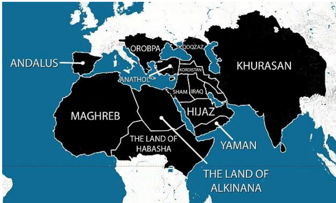
Figure 1 is a map showing ISIS’ long term ambition for taking over the Muslim world.

The objective of ISIS is to create and control an Islamic State over all Muslims, imposing its version of Sharia law and establishing centralized governance. ISIS announced in June 2014 the formation of the Islamic State and named Abu Bakr al-Baghdadi the caliph to whom all Muslims owe their loyalty. In the announcement they declared that, “The legality of all emirates, groups, states, and organizations, becomes null by the expansion of the khilāfah's authority and arrival of its troops to their areas.” 8